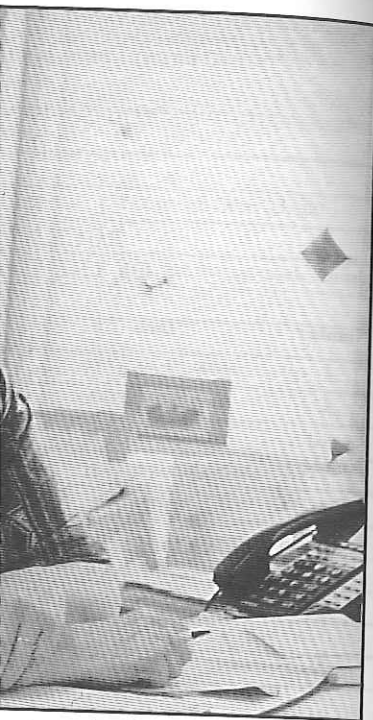
g is under control."