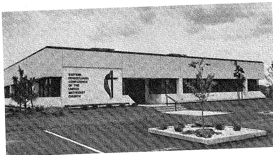
Eastern Pennsylvania Conference Center Valley Forge, Pennsylvania