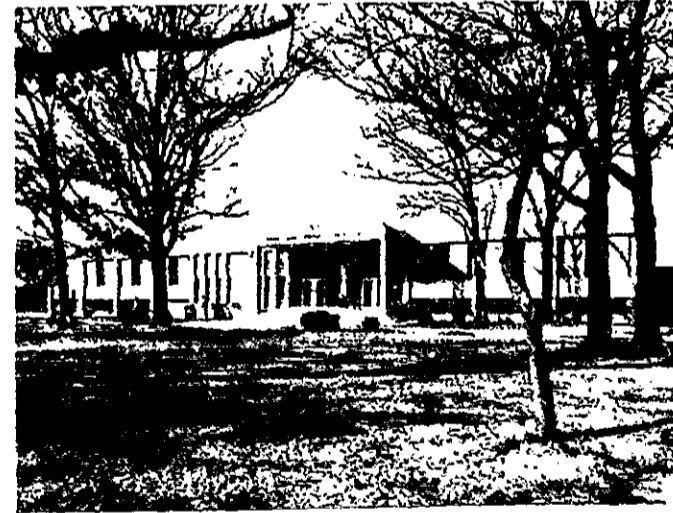
REMBERT BENNET BURGESS STUDENT CENTER