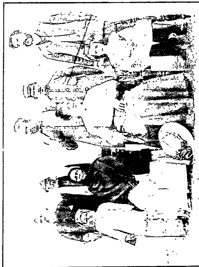
CHRISTIAN WORKITE, NARANA CIRCUIT.

The mass of the people are occupied in agriculture. In the large towns banking and commerce flourish to a degree beyond what would be expected for so backward a country. In the north the staple products for exports are salt, grain, wool and cotton: in the south opium and cotton; while the imports consist of sugar, hardware and piece goods. Rajputana is very poor in industrial production. The principal manufactures are salt, cotton and woollen goods, carvings in ivory, and