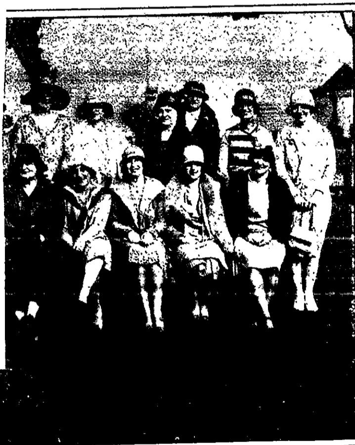
VIEWING THE OPEN SPACES THEY HEAR SO MUCH ABOUT: GUESTS Who Enjoyed the Annual Ladies' Day Outing of the Jamaica Realty Board in Patchogue.