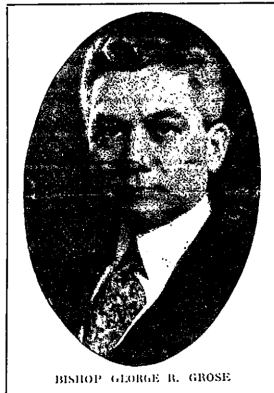
BISHOP GEORGE R. GROSE

on the way. For such a day of inhuman toil, these men, clad in rags or in the cheapest cotton cloth, receive twelve to thirteen cents. To be sure, they are the lowest type of coolie laborers. But as long as they are forced to live on the narrowest margin of economic existence they are doomed to this degradation. Greedy foreign commercialists, exploiting these poor human creatures, are themselves living in luxury in Shanghai or in Western cities. Typical of the attitude of some foreign business men in the Orient, one remarked recently: "I'm going to get all I can, as soon as I can, in any way I can, and then get out of China, while the getting is good." Is it any wonder that Orientals judge Western civilization, not alone by the schools and hospitals and churches founded by the missionaries, but also by the selfish indulgence and by the brutal industrialism of Western foreigners? Some business men in China shamelessly boast of profits of three hundred to one thousand per cent. on their investments. How long will the modern world